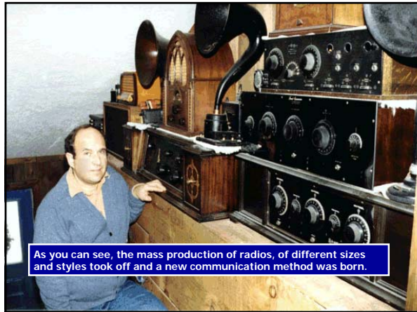
As you can see, the mass production of radios, of different sizes and styles took off and a new communication method was born.