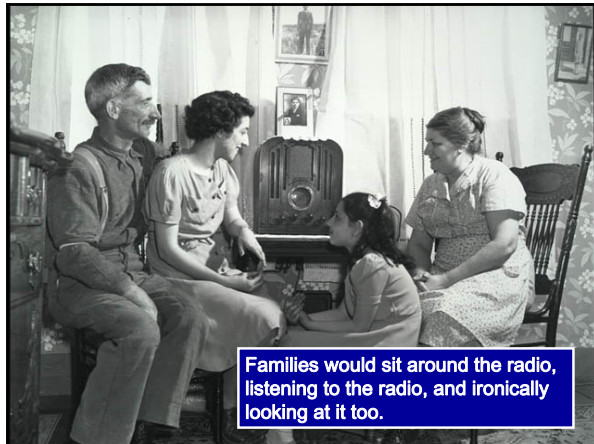
Families would sit around the radio, listening to the radio, and ironically looking at it too.