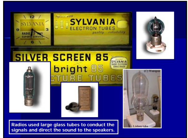
Radios used large glass tubes to conduct the signals and direct the sound to the speakers.