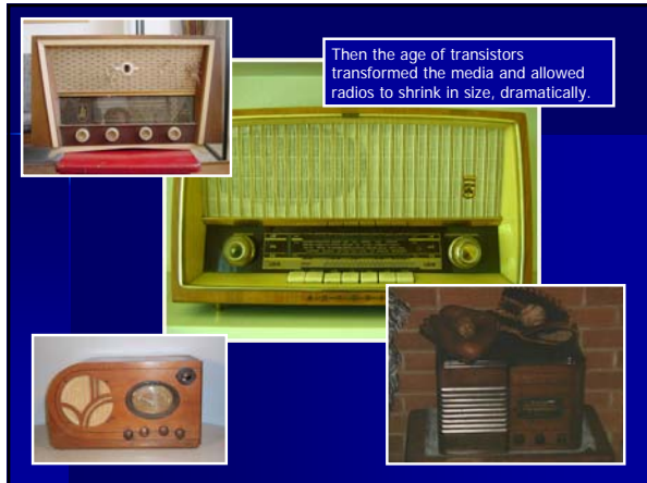
Then the age of transistors transformed the media and allowed radios to shrink in size, dramatically.